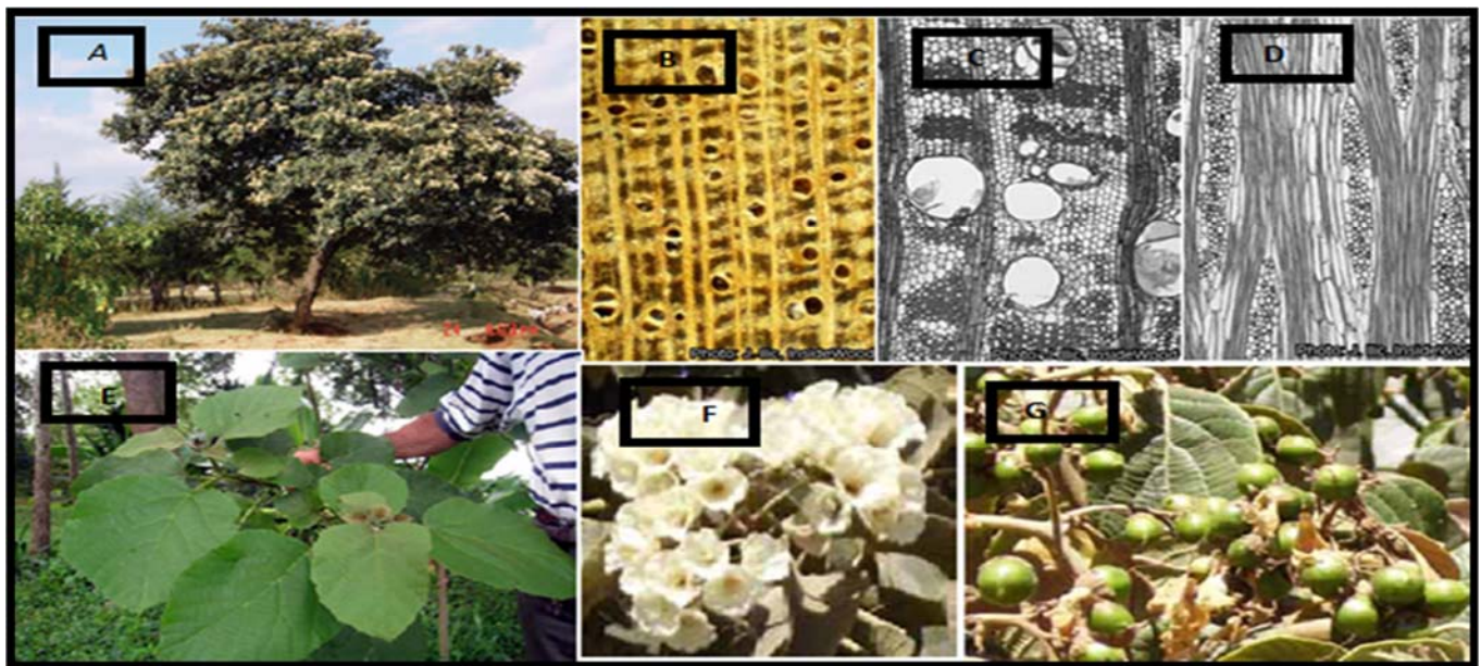
Fig 1: Vegetative and reproductive parts of Cordia africana Lam. A) Rounded crown B) Wood in transverse section C) Wood in transverse section D) Wood in tangential section E) Leaf shape F) Flower G) Matured fruit

Flowers funnel-shaped, pure white, sweetly scented, produced in quite large bunches. All the flowers on one tree open at the same time giving a very decorative effect. Fruit circular, up to 1 cm in diameter, yellow when mature and single-seeded [61]. The sweet sticky flesh is edible. Seeds ellipsoid to reniform, dark brown to black [58]. The seed coat is tough, leathery and waterproof. Seeding time is highly variable, but August–September appears to be the best season. Seeds remain viable at least for one year. However, best germination occurs with fresh seed. Germination begins in two weeks, proceeding unevenly for up to two or three months.