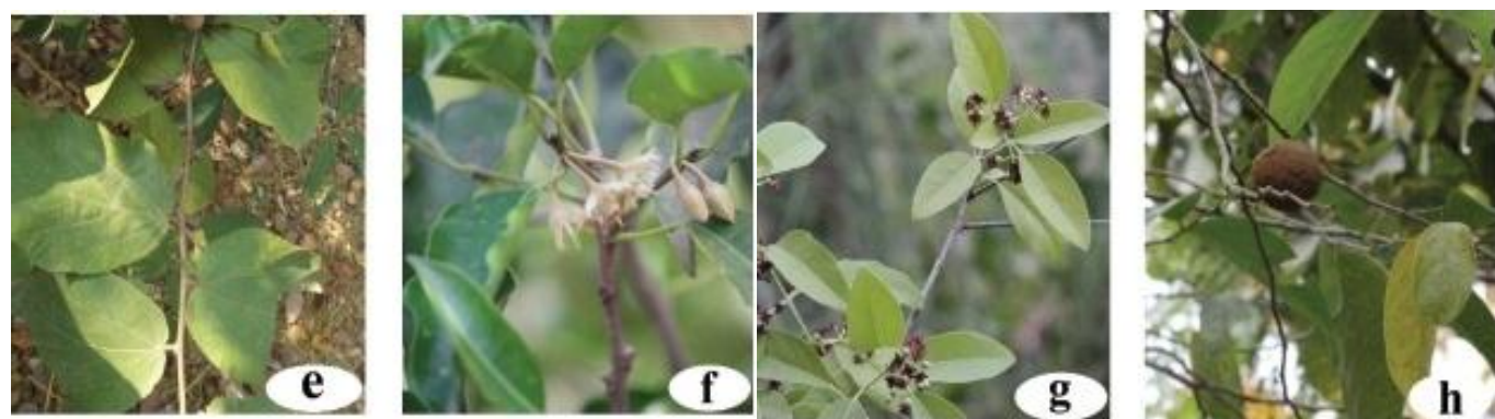
Fig 3: RET species in study area