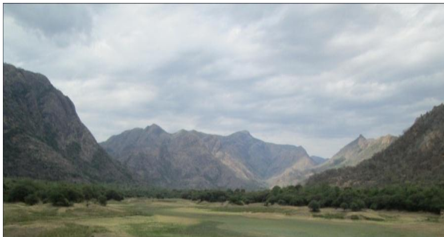
Fig 1: A view of study region

Sanctuary Srivilliputhur taluk, Virthunagar district of Tamil Nadu. Sadhuragiri is located at 1200 meters (3,937.0 ft) mountain in the part of Western Ghats of South India. It lies between 9°. 42' - 9 °.44" West latitude and between 77 °.37 - 77°. - 41" East longitude and it has an elevation of 881 meters above sea level. Sadhuragiri is in an area with a Tropical evergreen forest, Semi evergreen forest and mixed deciduous forest climate. Fig: 1).