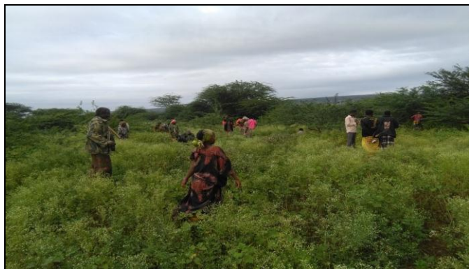
Plate 1: During Site observation with the local community

nursery site was found, it is located in Eastern Harerghe Zone of Oromia Region, 42 km East of Harar. A participatory Rural Appraisal following (Victor et al , 2007) [11], were conducted from May 5 to 25, 2016 on the early infested experimental nursery site. Accordingly, at erer bada kebele, 15 Hectare of prosopis juliflora early infested nursery site was taken as an experimental site. To determine the required amount of human power in the eradication campaign, three imaginary line transect were laid to guess the cover abundance of prosopis juliflora . 5 representatives 20m by 20 m sample plot from the four directions and one center plot were taken. Based on the count result of each plot the average cover abundance of prosopis except other three were determined. Based on the abundance of prosopis 150 local people for 3.5 hour campaign were determined.