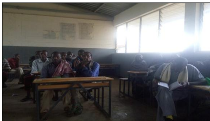
Plate 2: Stakeholder Consultation; (Photo by Yeneayehu Fenetahun, 2016)

Multi-stakeholders were identified with consulting the Woreda Administration, Kebele Administration, Woreda and Kebele Agricultural offices. Based on the information share between the governmental sectors at Woreda and Kebele level, 150 local peoples were selected voluntarily. Following selection a mini consultation meeting was conducted. The consent of all these parties will be understood through awareness creation meetings.