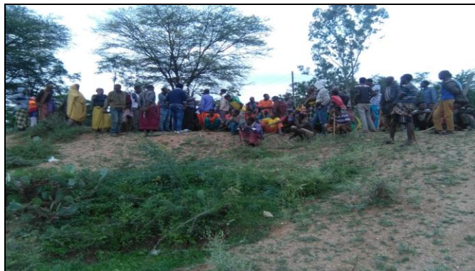
Plate 3: Mini awareness session at the site with the local people; (Photo by Yeneayehu Fenetahun, 2016)

indigenous method they already used. During the stakeholder awareness session the local people described as the most usable method in controlling the spread of prosopis is Chopping of the stem. However, the local people evaluate their previous trial as have had no or little effect in controlling the spread of prosopis infestation due to their inherent limitation absence of an integrated control strategy.