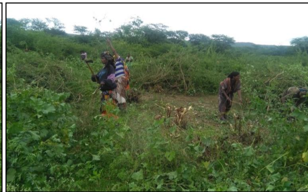
Plate 5: During eradication of prosopis from the nusery site