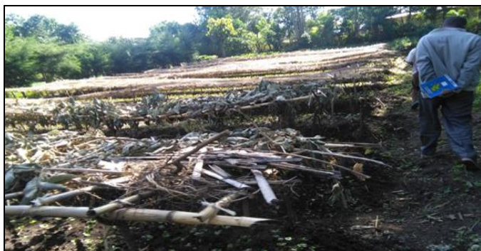
Plate 7: The local friut and forest spices aat the nusery site