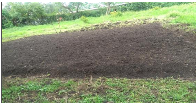
Plate 6: Aftre eradication perpartaion of nursery site