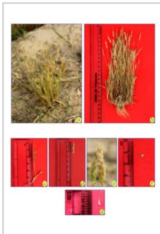
Fig 2: Alopecurus aequalis Sobolewski: a. Natural habitat; b. Dry specimen; c. Leaf; d. Panicle; e. Spikelets; f. Glume; g. Awn