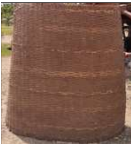
Fig 2.3a: Kanaja bult by bamboo

This whole sheath is folded in such a way to get cylinder like structure and tied the edges. This entire cylinder is placed on the ground directly or placed on the wooden floor made by wooden plates. Kanaja wall is smeared by slurry made by the mixing of cow dung in some case farmers use purified red soil powder in paste form for smearing on both the surface of the wall. This cylinder is known ready to use, before paddy is poured in firstly the bottom is covered with paddy husk (hottu) for 2-3 inches, this avoids paddy from direct contact with floor and prevent the cold effect.