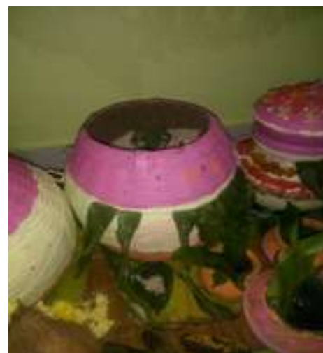
Fig 2.3c: Bamboo basket