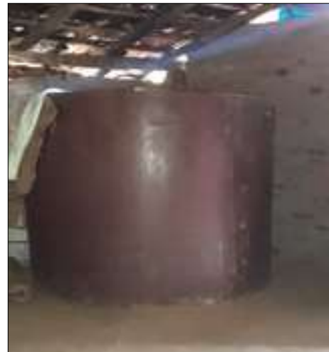
Fig 2.3b: kanaja bult by alluminium sheth