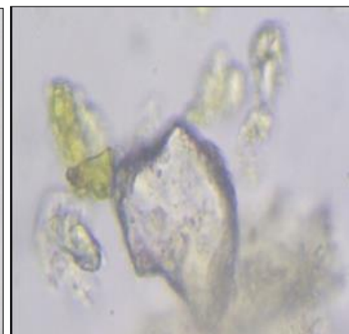
Silica deposition of Amalaki