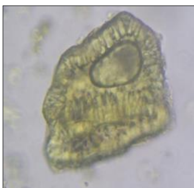
Stone cells of Haritaki