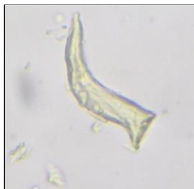
Trichome of Bibhitaki