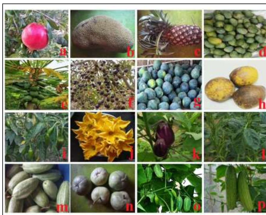
Fig 1: Photographs of Punica granatum L. (a), Artocarpus heterophyllus Lam. (b), Ananas comosus (L.) Merr. (c), Mangifera indica L. (d), Carica papaya L. (e), Buchanania lanzan Spreng. (f), Citrullus lanatus (Thunb.) Matsum. & Nakai (g), Aegle marmelos Correa. (H), Capsicum frutescens L. (i), Cucurbita maxima Duch. Flower (j), Solanum melongena L. (k), Cyamopsis tetragonoloba (L.) Taub. (l), Trichosanthes dioica Roxb. (m), Praecitrullus fistulosus (Stocks) Pangalo (n), Coccinia grandis (L.) Voight (o) and Cucumis sativus L. (p).