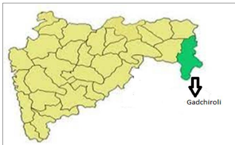
Fig 2: Map of Maharashtra showing study area