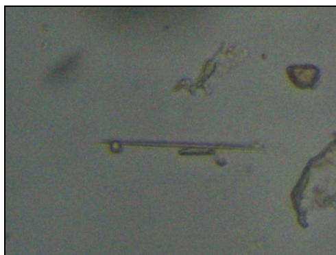
I. Acicular crystal of Rasna