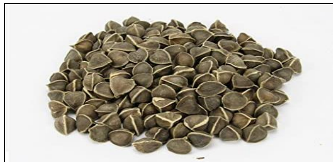
Fig 1: Moringaoleifera Lam. (Seeds)