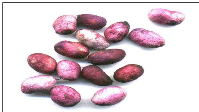
Fig 2: Syzygiumcumini (L.) Skeels (Seeds)