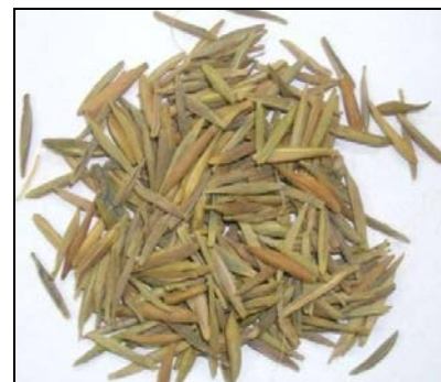
Fig 2: Seeds of Holarrhena antidysenterica (Tewāj)