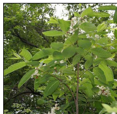
Fig 3: Leaves of Holarrhena antidysenterica (Tewāj)