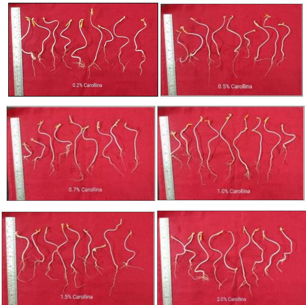
Fig 1: Effect of seed treatment with different concentration and different time period of Corallina berteroi SLF on the seedling growth of Vigna radiata L.