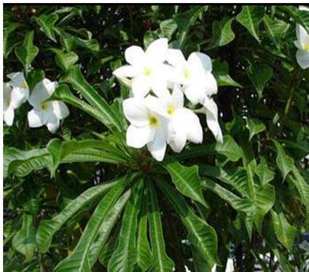
Fig 2: Plumeria pudica Jacq.