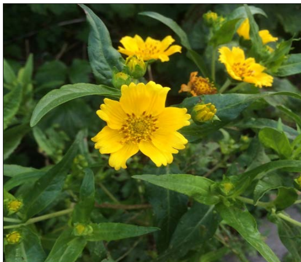
Fig 1: Guizotia abyssinica (L.f.) Cass.

So, far no any systematic study was carried out in evaluating the standardization parameters of roots of selected plant, therefore, the present work was undertaken.