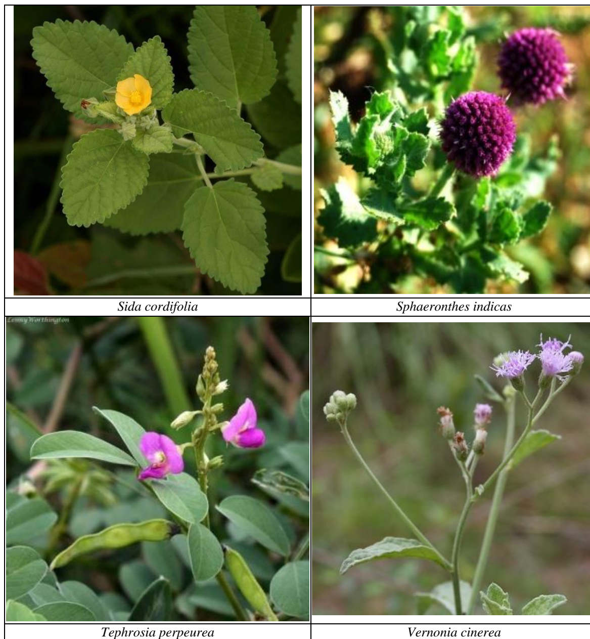
Fig 2: Photo Plate of Medicinal plants