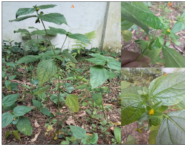
Fig 1: Photograph of Eleutheranthera ruderalis A. Natural view B. Bract, C. Capitula.

Pabna: Ishurdi, Paksi, Railway officer’s quarters area, 24 x 2023, Md. Tarikul Hasan, MTH 2721 (Department of Botany, Rajshahi Government City College, Rajshahi).