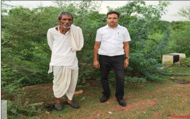
Fig 3: Interactions with different tribal communities of Dang area of Rajasthan.