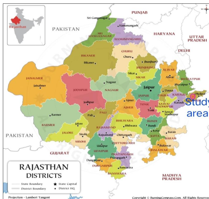
Fig 1: Map of Rajasthan state showing study area

Dang area is one of the most resource dispossessed and arid region of Rajasthan state marked with degraded ravines, barren land and severe water shortage. Dholpur and karauli districts with an area of 6034 square kilometers is located in eastern most extremity of the state of Rajasthan and lies between latitudes 22o21'19" and 26o57'33" North and longitude 77o13'06" and 78o16'45" East.