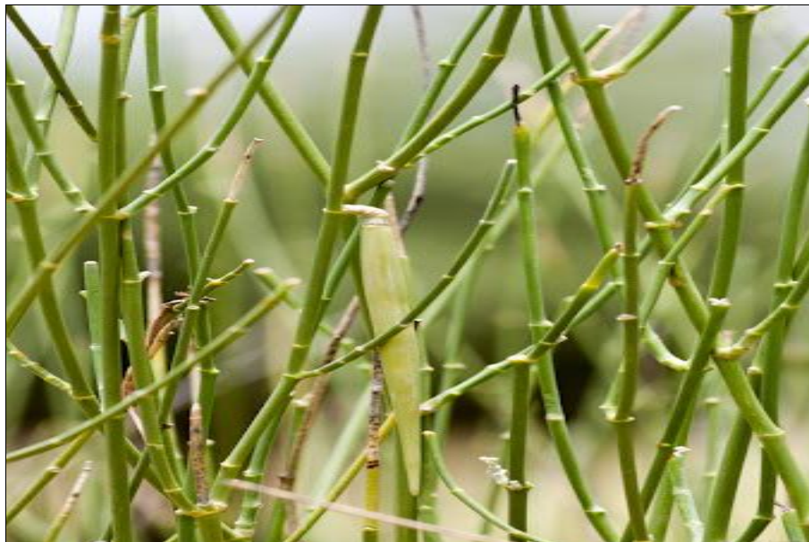
Fig 1: Stem of Leptadenia pyrotechnica