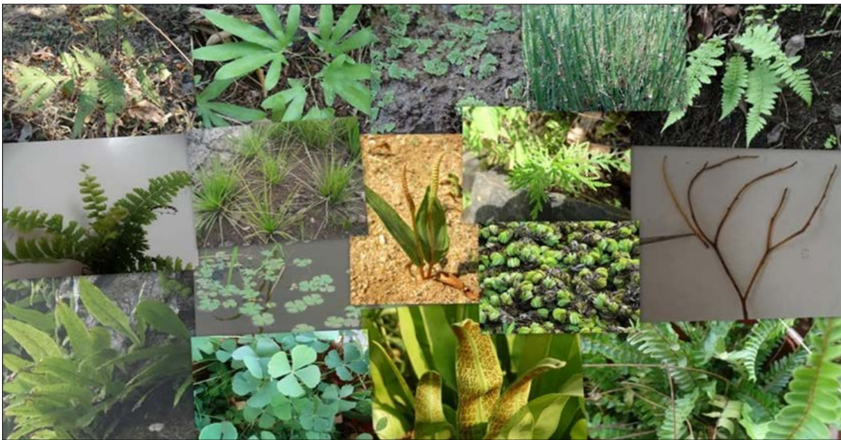
Fig 3: Pteridophytes studied at the Purandar Tehsil

The plant diversity assessments were directed to list plant species to find out the ecological, economical standings. The cryptogamic plants forms which include algae, fungi, lichens, Bryophytes and pteridophytes were also observed, identified and studied. Pteridophytes observed and studied were Actinopteris dichotoma , Adiantum caudatum , Athyrium falcatum , Azolla pinnata , Lygodium sp. , Marsilea quadrifolia , Microsorium membranaceum , Microsorium punctatum , Nephrolepis cordata , Pteris sp. , Salvinia sp. , Selaginella krausiana , Tectaria cicutaria . Fig.3