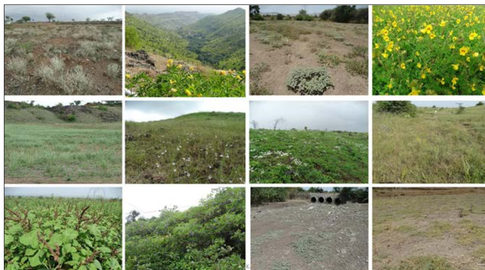
Fig 2: Various Common and Abundant flowering plant species and their Habitat

Plant diversity and ecological assessments, investigations were performed by consistent visits to the Purandar fort and tehsil during 2014 to 2020. Initially The identification of plants was practiced by the random walk method and simultaneous listing of plants was done. Accomplishment of keen observations was a result of these visits. Plants were categorised based on their form into trees, climbers, shrubs and herbs. The field work, observations, empirical and interpretative approach was brought in the practice to the document the seasonal variations. Fig.2