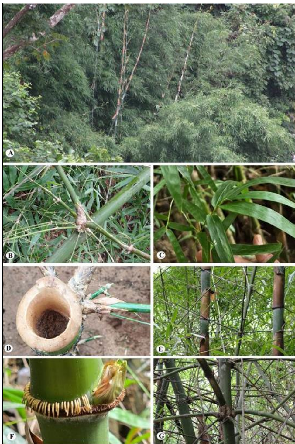
Fig 1: A. Habit B. Branching pattern C. Leaves D. Culm sheath F. Nodes G. Branching stem

into cetaceous, scabrous, ca 5 mm long pointed apes; glabrous on adaxial surface except few scabrid nerves along one margin, sparse fine hairy usually on one half on abaxial surface first, afterword nearly glabrous; midrib prominent raised, very fine ciliate 9n lower onethird, glabrous upwards, secondary viens, 10-12 pairs, tertiary 7-9, no cross viens overrated on both margins; leaf-sheath lowest 8-10 cm long glabrous, striate, keeled, ending into rounded, shining, smooth callus, smooth at margins; ligule 0.5-1 mm long, slightly oblique, minutely ciliate near petiole otherwise glabrous; auricles roundedly elongate bearing ca 5 mm long deciduous, straight bristles, one pointing upwards and the other downwards and short, rounded in upper leaf-sheaths.