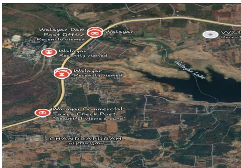
Fig 1: Study area map of the Walayar region, Palakkad district, Kerala, India.

semi-evergreen and dry deciduous vegetation, interspersed with scrub forests, grasslands, agricultural fields, and riparian habitats associated with the Walayar River (Fig.1). The area receives an annual rainfall of 1,500–2,200 mm and experiences a tropical climate that supports rich medicinal and aromatic plant diversity (Champion & Seth, 1968; Venkatachalapathi et al. , 2018) [1, 17].