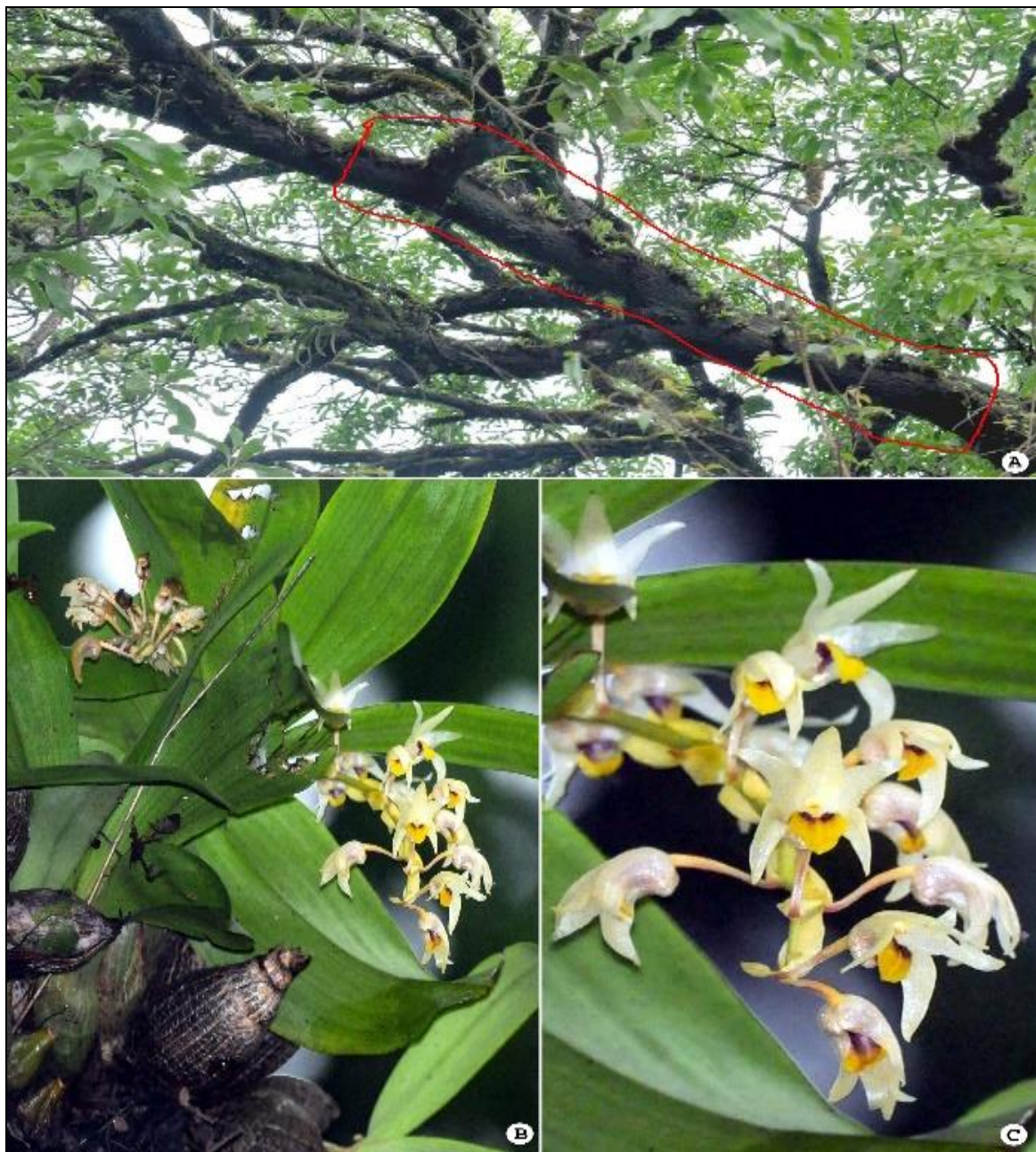
Plate 1: A. Habitat of Pinalia mysorensis , B. Habit in flowering, C. Inflorescence

from at least 22 locations, including four protected areas viz. , Bhadra Wildlife Sanctuary, Sharavathi Valley Lion-tailed Macaque Wildlife Sanctuary, Anamalai Tiger Reserve and Kalakad Mundanthurai Tiger Reserve, where it currently does not face direct anthropogenic threats, although the possibility of indirect habitat disturbance cannot be ruled out. The species is not considered to be severely fragmented, and although habitat quality is affected by urbanization, forest fragmentation, and developmental activities, it remains common in many localities. Field surveys in Maharashtra reported more than 50 mature individuals with good fruit set, suggesting healthy reproductive success. The overall population size is not precisely known but is inferred to be stable, and ongoing habitat loss is not projected to cause a continuous decline in mature individuals in the near future. Based on this evidence, the species does not qualify for any threatened category and is therefore assessed as Least Concern (LC).