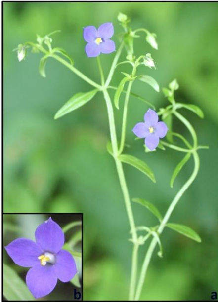
Fig 2: Exacum lawii C.B. Clarke; a. Habit; b. Flower

Specimen examined: SKP-63, 09.ix.2018, Hanuman Kot (23.95555556 N & 73.48638889 E, 544m), Vagheshwari forest area, Bhiloda, Aravalli District, Gujarat, India. (College S.K. Patel, Gujarat Arts and Science College, Ellis bridge, Ahmedabad, Gujarat) (Fig 2-3).