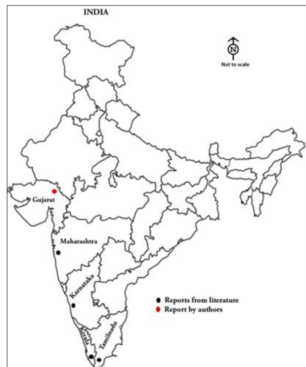
Fig 1: Location map of Exacum lawii C.B. Clarke in India

apex. Corolla tube white, lobes-4, blue-violet, broadly obovate, acute-obtuse at apex. Stamens-5; filaments short, white, fused to the corolla, anthers yellow, erect, rectangular, opening by apical pores that later do not widen to slits, papilla absent. Ovary green, ovate, style bluish white, 2-3 mm long, straight as long as the stamens or a little beyond; stigma simple, capitate, faintly 2-lobed. Capsule brown, Seeds many, irregular or tetrahedral with shallowly sunken sides.